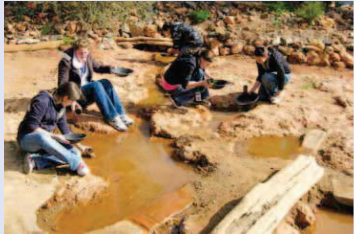
Figure 4.20: Woodvale SHS students panning for gold on a trip to the mining Hall of Fame in Kalgoorlie.

Hydrothermal vein deposits form along joints or fractures in rocks that have been filled with minerals precipitated from heated mineralised fluids. These high-grade vein deposits contain a variety of minerals and were the main type of deposit to be mined by man throughout the ages. In the present day hydrothermal vein deposits are mined for tungsten, tin, gold, uranium, cobalt and silver. A significant proportion of Australia’s gold production is won from hydrothermal vein deposits within the Archean greenstone belts of the Yilgarn Craton in Western Australia.